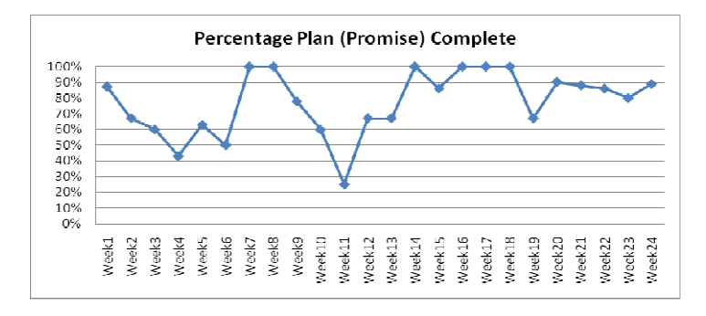
Figure 2: Percentage of Plan Complete over a Period of 24 Weeks (Calculated on Weekly Basis)

foremen in charge of the work, but it was carried out by the project engineer getting input from field crew on what work would be completed during the current week and inquiring what work would be done in the coming weeks. Initially, the percentage of promises completed was low. But, after 14 weeks of data collection, and the understanding of performance gained by keeping promises, along with the positive feedback when promised work was fulfilled correctly, completely and on time, the PPC increased above 80% for a period of nine weeks. The average project PPC was a remarkable 77%, which requires some explanation.