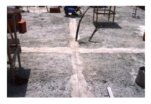
Figure 10: Orthogonal axes

Drawings were profusely displayed on site but a missing link was observed. There was no device to translate what was drawn to the real world. Operatives would normally accomplish this by trial and error, putting some blocks at one of the extreme concrete slab right corners, starting their masonry activities from there on. This is a condemned practice as setting out errors might accumulate throughout the rest of the slab. A new approach was suggested marking orthogonal axis by the middle of the slab, as shown in figures 10 and 11.