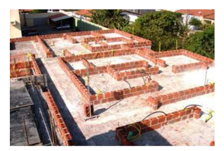
Figure 8: Work pakage

requirements. This is to say that not only materials were supplied in batches according to the different parts of work as described, but also that work was taken as different, even if all stages deal with the same blocks and mortar. A clear understanding on how work was really performed was incorporated in everyone's reasoning. A practical outcome was the extension of the batching practice to the external supplier of blocks, according to these three different stages, what easy cash flow requirements and stockyard logistics.