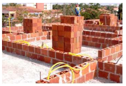
Figure 9: Material Package

Drawings were profusely displayed on site but a missing link was observed. There was no device to translate what was drawn to the real world. Operatives would normally accomplish this by trial and error, putting some blocks at one of the extreme concrete slab right corners, starting their masonry activities from there on. This is a condemned practice as setting out errors might accumulate throughout the rest of the slab. A new approach was suggested marking orthogonal axis by the middle of the slab, as shown in figures 10 and 11.