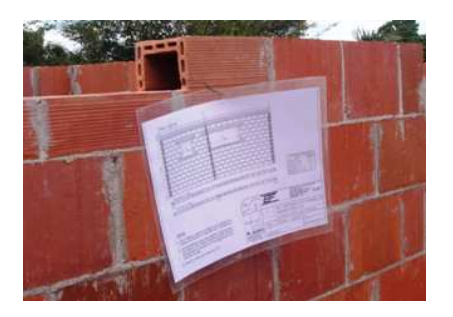
Figure 2: Masonry pagination