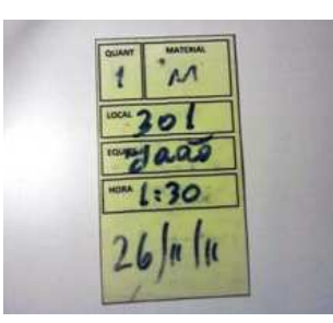
Figure 3: Kanbans.

Apart from these lean principles that follow from the technology itself, this construction site experimented two organizational tools. First kanban signaling was used to order materials. Those in charge of supplying from external sources and commanding logistics on site did use a heijunka panel to find adequate sequences for materials' distribution. Figure 3 and 4 illustrate respectively kanbans and a heijunka panel as used on this construction venture. Second, just in time ordering of materials and execution of preceding work was enforced.