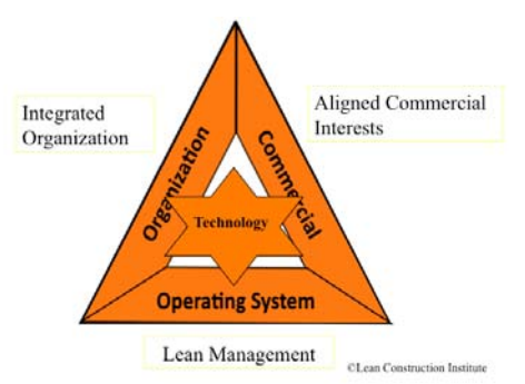
Figure 3: LCI Triangle (adapted from Howell 2011)

For projects to approach optimality, three elements are required (shown in Figure 4):