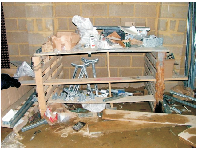
Figure 4: Improvised workbench and random storage of components.