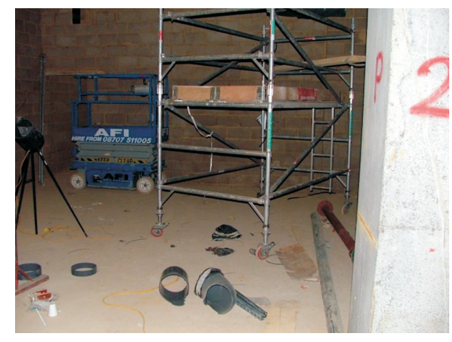
Figure 5: Unplanned workplace, conventional scaffold.