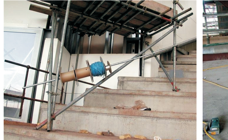
Figure 1: Improvised cable dispensing.