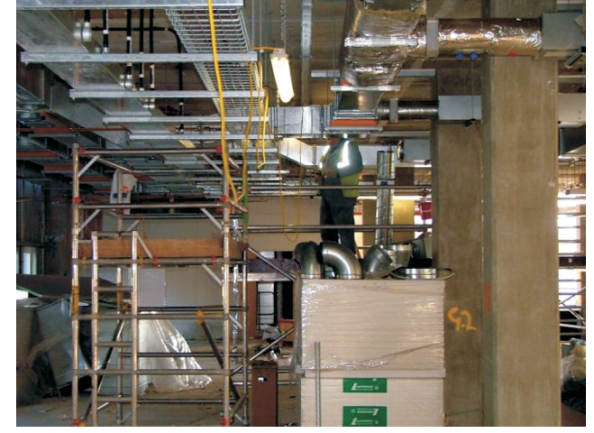
Figure 6: Various trades in same workplace, materials in each trades way.