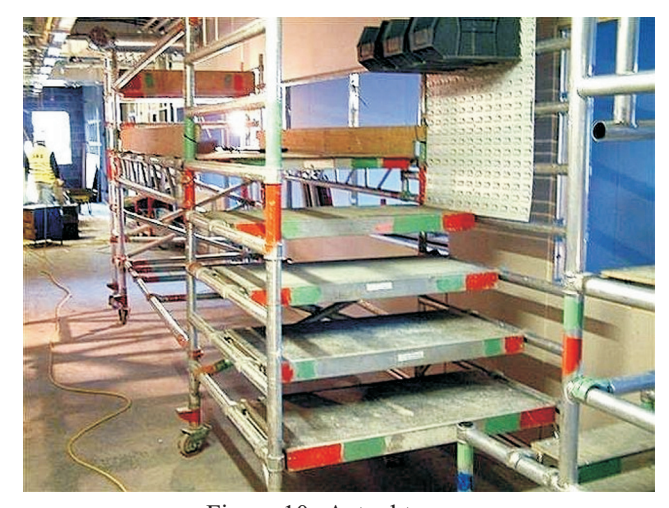
Figure 10: Actual tower.

This case study set out to measure the cost of labour used compared to the estimated labour cost, and consider its impact on the final margin of the project. To do this, actual labour used (not earned) was monitored on a weekly basis from the start of the project and compared to planned labour usage, and this is represented in Figure 11.