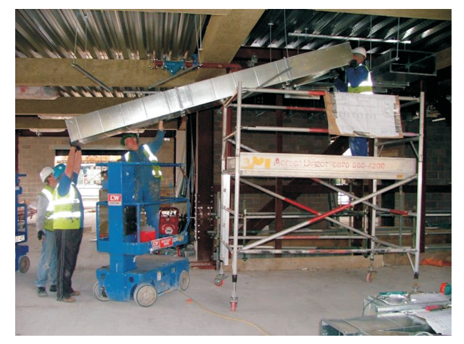
Figure 3: Conventional scaffolding and manual handling.