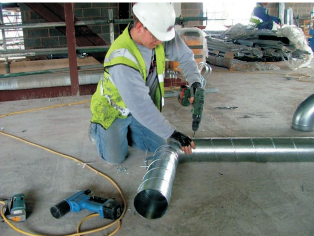
Figure 2: Working on the floor.