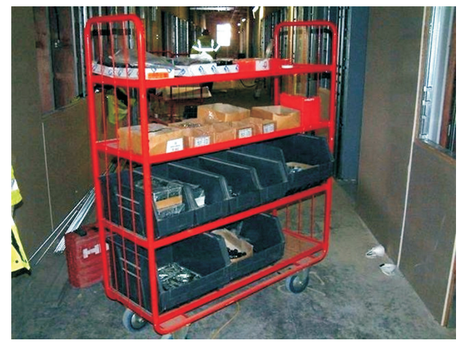
Figure 7: Mobile component trolley, with simple manual replenishment.