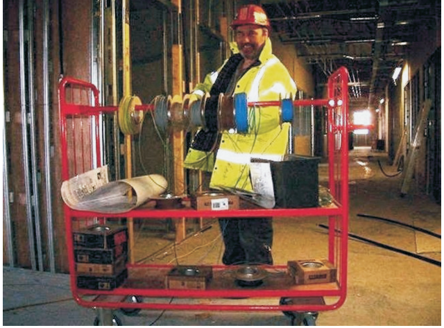
Figure 8: Mobile cable dispensing and component trolley with simple manual replenishment.

fixing supports, and the like. The tower is still assembled from standard sections but put together in a different way. It is readily accessible via a series of steps at one end to give access to the services working height, and a step-up "poop-deck" at the furthest end to provide higher access to the underside of the slab. On-board storage bins are provided which are refilled using a simple manual replenishment system.