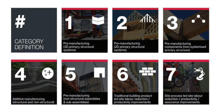
Figure 2: The MMC Definition Framework: Categorisation (MHCLG, 2019)