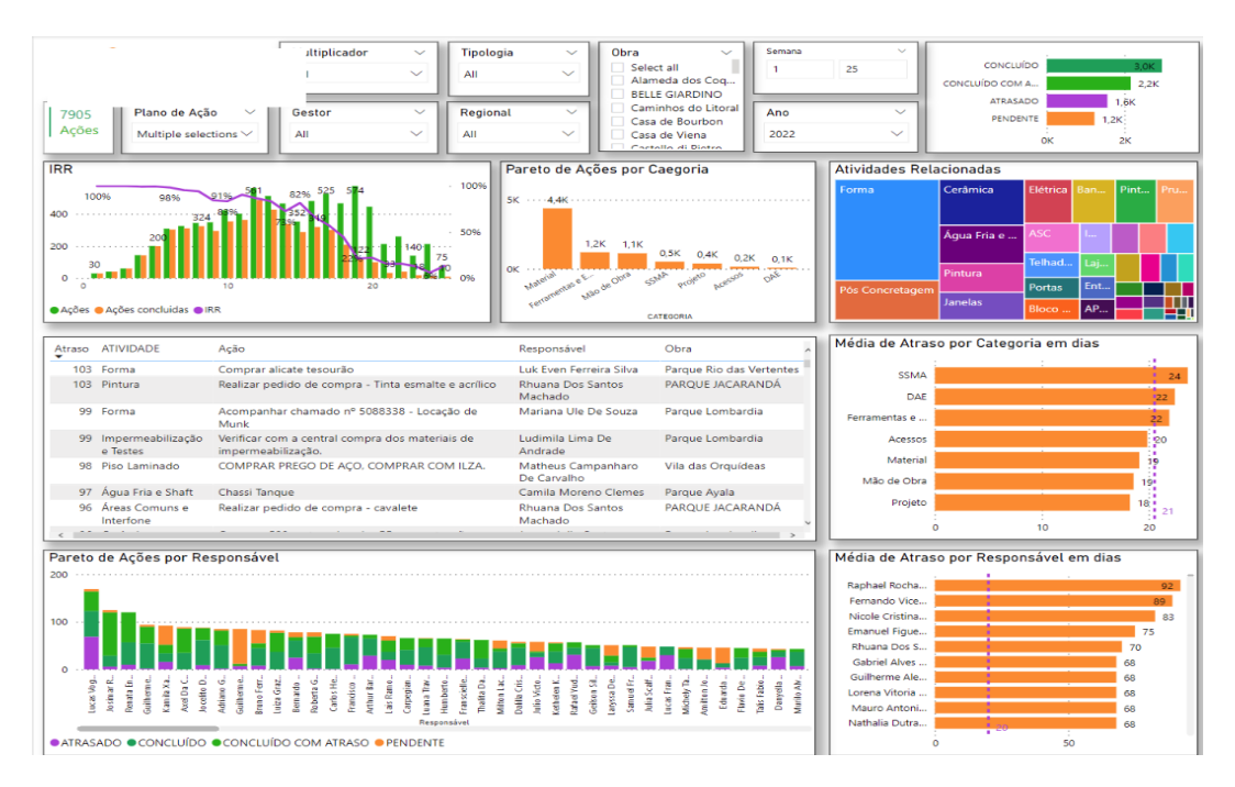
Figure 2 - 25 weeks data analysis

Also, with the beginning of the third cycle, implementing the lookahead planning was started for the other activities of the sites (condominium areas and infrastructure). Thus, a complete visualization could be obtained, and a protection window created for the next six weeks of the sites. Hence, this generated more action plans and larger amounts of data for the company's base, thereby enriching future decision making.