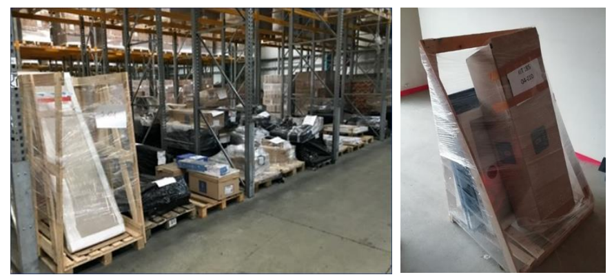
Figure 1 Example of kits at the CCC and after dispatch at the workspace