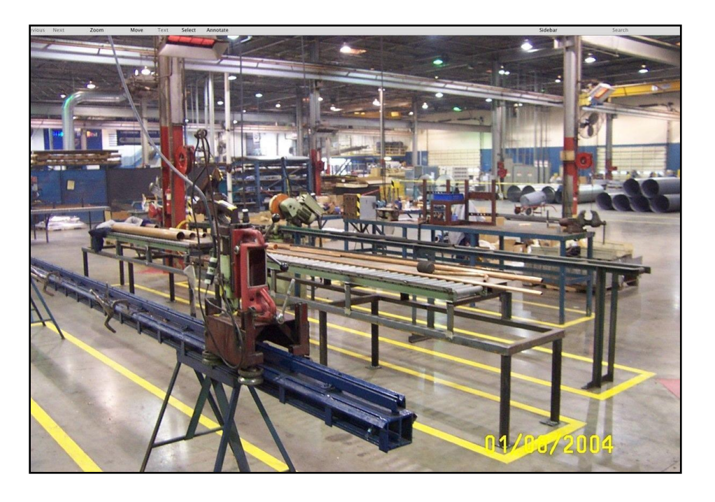
Before 5S After 5S