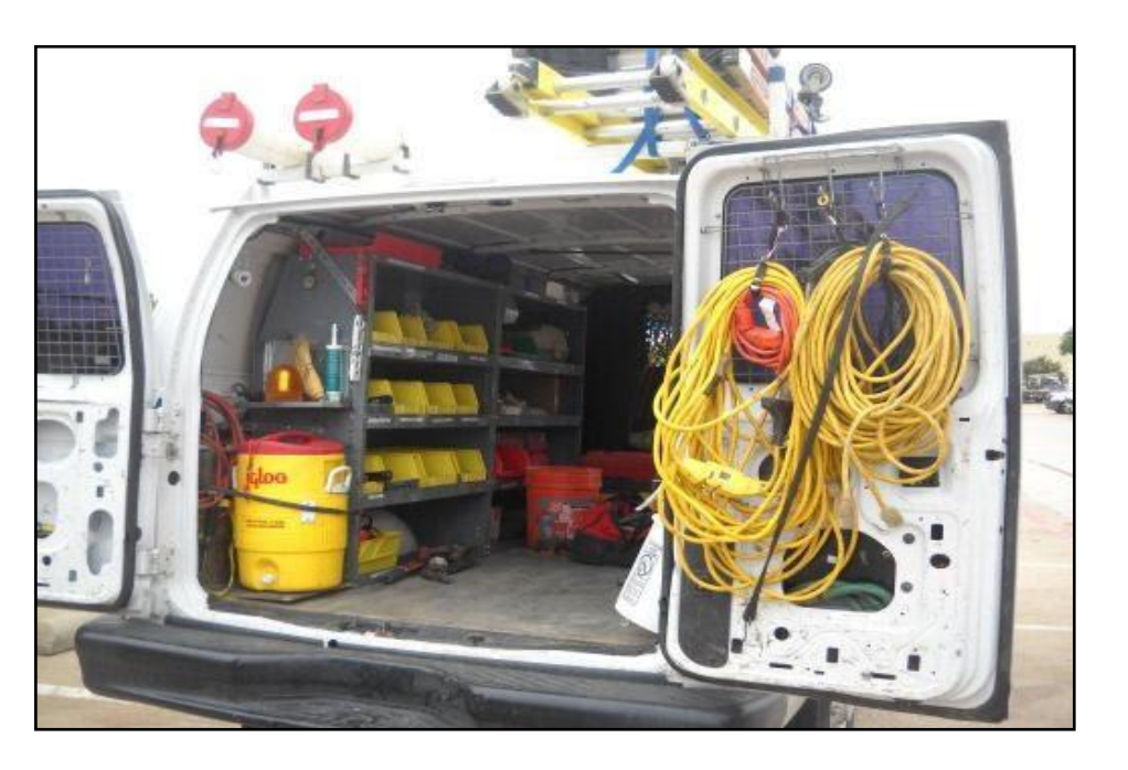
Before 5S After 5S