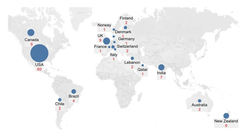
Figure 1: Location of Registered, Unique Participants

and simulations played, which cater to varying levels of sophistication in terms of understanding and application of lean concepts.