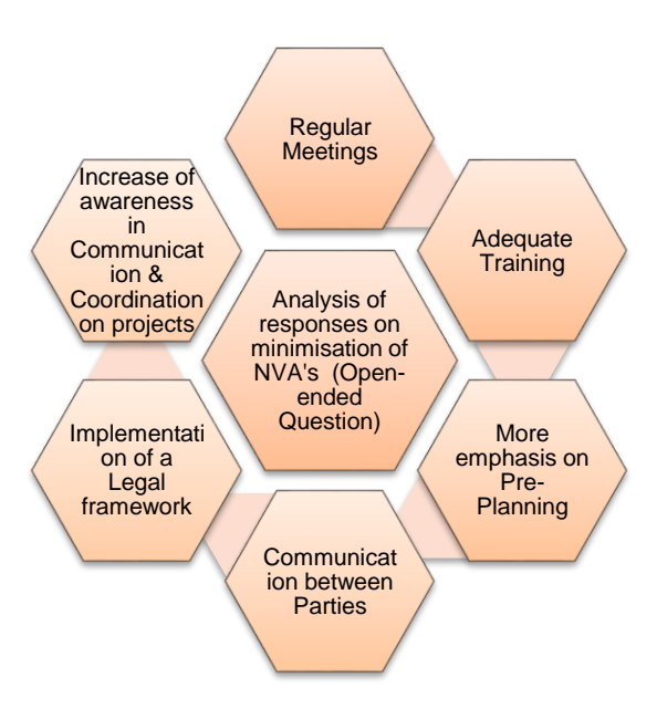
Figure 2: How to Minimise Non Value Adding Activities on Construction site in Gibraltar

Again, all these shows the central role clear communication and active collaboration plays in minimising NVA on a construction project.