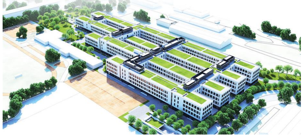
Figure 2: Project BMW Freimann (PORR Design & Engineering GmbH)

contained prefabrications and was finished in May 2018. Installation of the interior started in January 2018. Inspection of the first office area started in October 2018. Constructional completion was finished in December 2018 and commissioning and inspection were completed in February 2019. The occupation of the building started in March 2019.