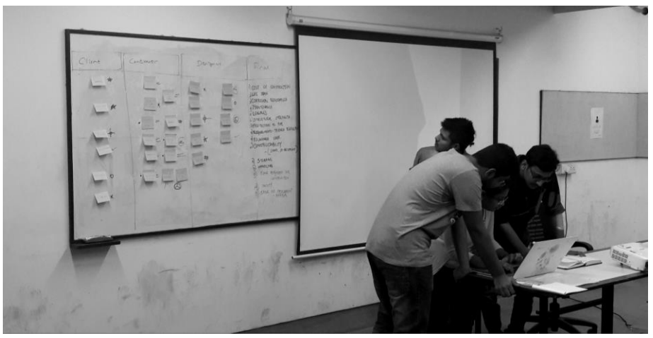
Figure 1: Discussion on advantages of alternatives

process at hand. Further, they played the role of "facilitator" for the role play exercise wherein collaboration and communication was facilitated. From the perspective of research method, the instructors also played an important role of "observer". Baker(2006) has described various roles of observer as Nonparticipation; Complete Observer; Observer-as-Participant; Moderate or Peripheral Membership; Participant-as-Observer, Active Participation, Active Membership; Complete Participation; and Complete Membership. Based on this typology, the role play by the instructor seems to equate to "Moderate or Peripheral Membership" wherein the researcher helps to "maintain a balance between being an insider and an outsider, between participation and observations" (Baker 2006).