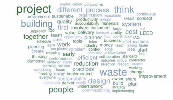
Figure 1: Word Cloud generated from interview transcripts. Researcher produced. 31 Mar. 2015.

onsite to get behind the 'I get, I give' philosophy of lean" (2015). Another positive to the Last Planner system is it utilizes a pull planning schedule that essentially builds the project backwards (Clem 2015). DPR keeps a whiteboard updated with the activities for the day so the entire project team can see what is going on, which puts positive pressure on the subcontractors to honour the commitments they made to each other and the broader project team (Laws 2015).