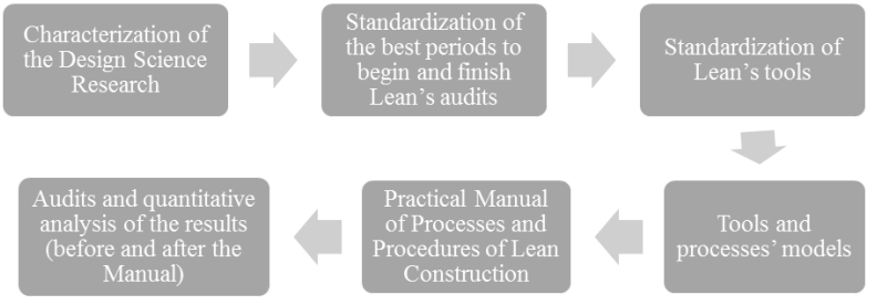
Figure 1: Methodology's flow chart

Thus, it was analysed quantitatively the performance of the construction sites before and after the use of the Manual, in order to assess whether there was an improvement in the application of lean concepts.