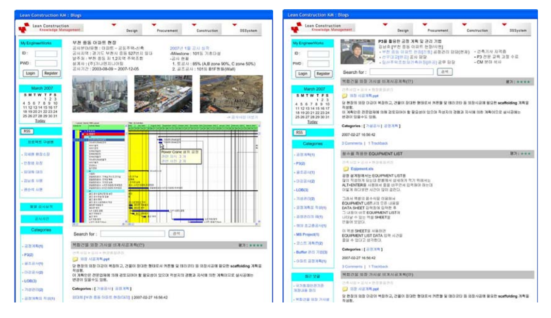
Figure 3: Project blog module (left) and Personal blog module (right)