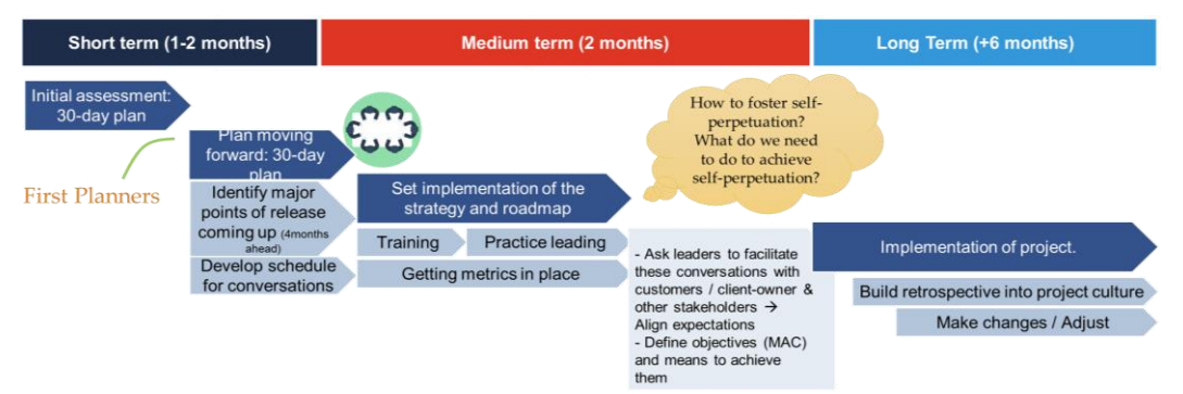
Figure 1: Research Design to Capture BBQ Implementation Process

Lewin (1946) and Somekh (2005) suggested that action research help to test and refine a concept or a process through the application of a set of improvements. This paper describes the first phase of an extensive research effort that applies an action research methodology. The authors seek to understand why and how the BBQ approach works in construction projects and what adjustments in the implementation process are needed for a successful implementation. The cycles of action research used in the study are presented in a step by step process (Fig. 1). In practice this process is not linear. Instead it involves a series of iterations of behaviors, constant interaction, and conversations in which the authors set the different steps to implement the BBQ concept.