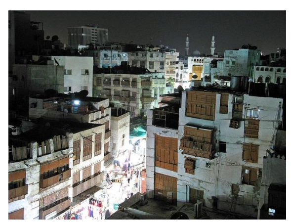
Figure 1: Historic Jeddah

The authors first conducted a literature review to identify best practices for preservation projects. Based on this review, the authors developed a process map (e.g., Damelio 1996) that illustrates the general guidelines for maintaining the integrity of the historic properties located in Historic Jeddah (Figure 1). The authors developed this process leveraging lean values –they recognized that a failure in the current system is that the local contractors do not understand what constitutes value for their customers, in this case the building owners and permitting agencies. This map documents a process that provides value to the permitting agencies, and in turn, building owners. In making the process transparent and explicit in the map, the authors support achieving the lean ideal, giving your customer exactly what they want, exactly when they want it, with nothing in store. In particular, this map illustrates a process to give the customers what they want when they want it.