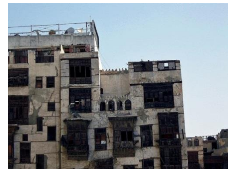
Figure 3: Existing Conditions of some properties at Historic Jeddah (left: from from <a href="http://ai.stanford.edu/~latombe/mountain/photo/ksa-08/ksa-08.htm">http://ai.stanford.edu/~latombe/mountain/photo/ksa-08/ksa-08.htm</a>, right: from <a href="http://gvshp.org/blog/2014/12/26/historic-preservation-in-context">http://gvshp.org/blog/2014/12/26/historic-preservation-in-context</a>; both visited 1 April 2016)